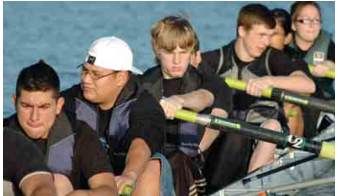
Rowing teams from NW Classen, US Grant, Putnam City, Capitol Hill, and Santa Fe South high schools wrapped up their fall season with the 2010 OKC RIVERSPORT SandRidge Youth League Championship in November.