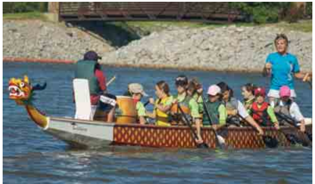
The OKC Boathouse Foundation partners with groups such as Big Brothers Big Sisters, Girl Scouts, Boy Scouts, the YMCA, the Oklahoma History Center and the American Indian Cultural Center and Museum to offer unique experiences to youth from all walks of life.