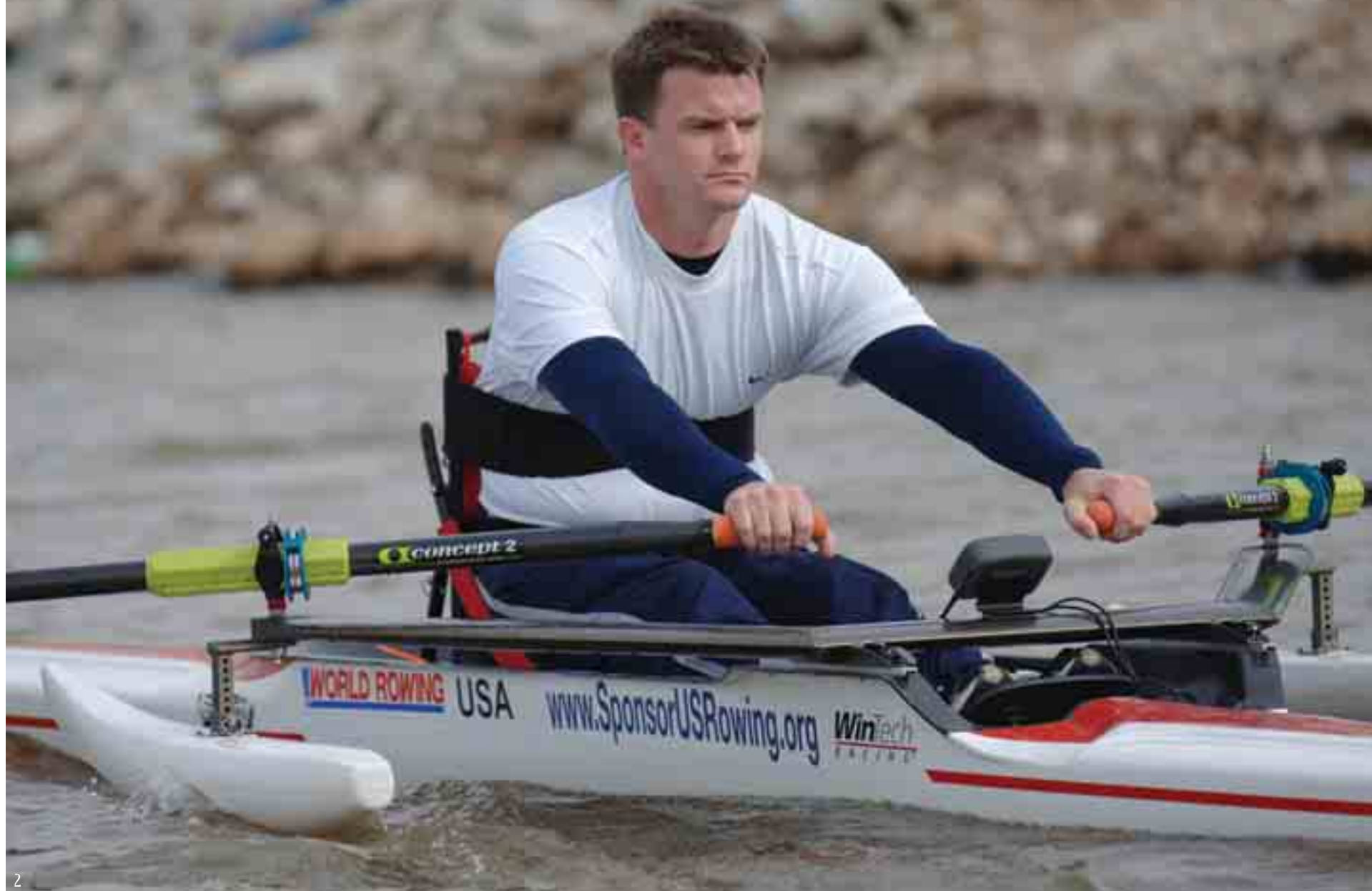
The USRowing National Adaptive Team holds training camps on the Oklahoma River.